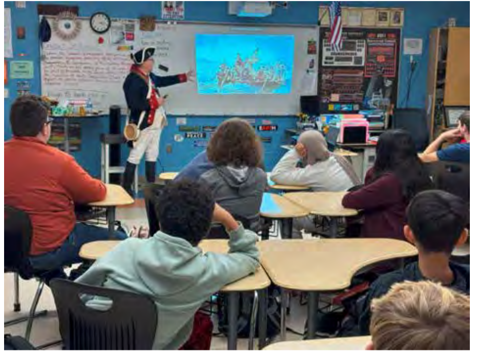
Photo # Mars Academy 2024: On Veterans Day, Monday, November 11th, four (4) compatriots from the Cincinnati Chapter, one (1) from the Camp Charlotte Chapter, and one (1) from the Hocking Valley Chapter posted the National Colors at a Veterans Day program at Mars Academy in Mason, Ohio. Afterwards, the compatriots gave a presentation on the Revolutionary War and an outside musket firing demonstration to 6th graders.