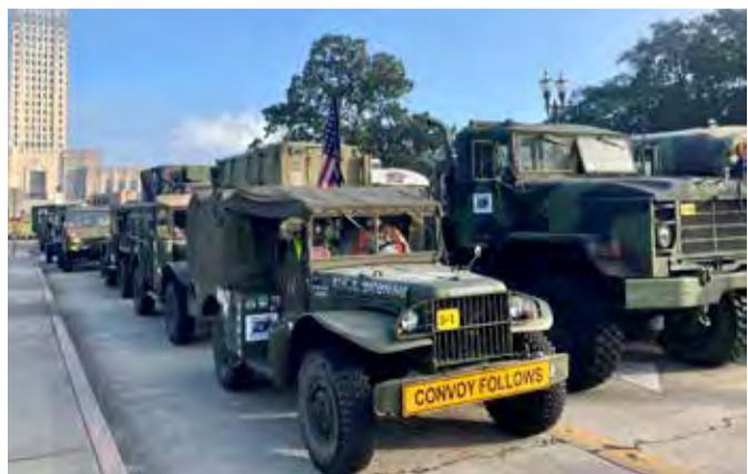
Left The Jefferson Highway Convoy of vintage restored U.S. Military vehicles, which began its 1,000 mile trek from Canada at the beginning of the Jefferson Highway. The convoy made its way to the Louisiana State Capitol in Baton Rouge on November 23rd. Greeting them were GPT-SAR