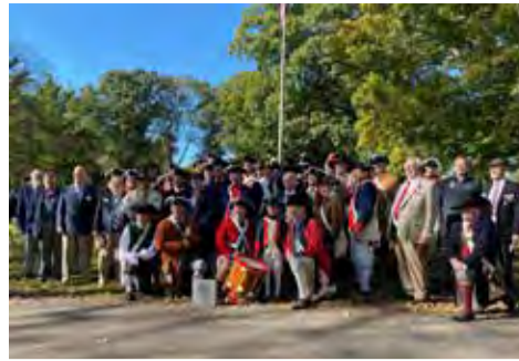
Several Ohio Society members from various chapters participated in the Central District Patriot Grave Marking and commemoration of the Lochry Massacre in Aurora, Indiana on Saturday, October 19th.