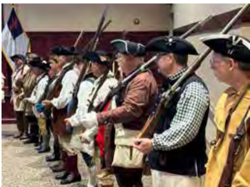
: Color Guardsmen listen to instructions prior to the ceremony commemorating the Camp Charlotte Treaty. The program was hosted by the Camp Charlotte Chapter SAR located in Circleville, OH.

: On Friday, November 8th, five (5) members of the Hocking Valley Chapter and one (1) member of the Camp Charlotte Chapter provided a color guard for two (2) assemblies of school children for a Veterans Day Program at the Licking Heights South Elementary School in Pataskala, Ohio. The students of the school also invited family members who were veterans or currently serving in the armed forces. Pictured, the compatriots also visited two (2) fourth grade classes and gave presentations on the Revolutionary War.