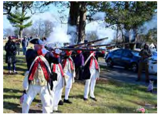
Oct 19 – Historical Annapolis - DAR and Color Guard