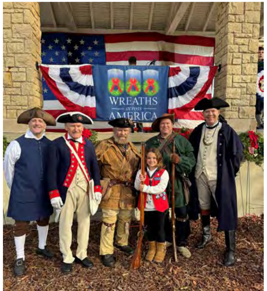
A young attendee with members of the Gov Isaac Shelby chapter after the ceremony.