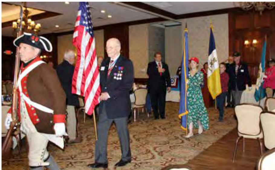
VAL_Vets: Group photo of the many of the Veterans in attendance.