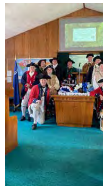
Members of the color guard after the ceremony in the church.