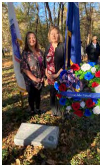
Members of the DAR presenting their wreath at the grave site