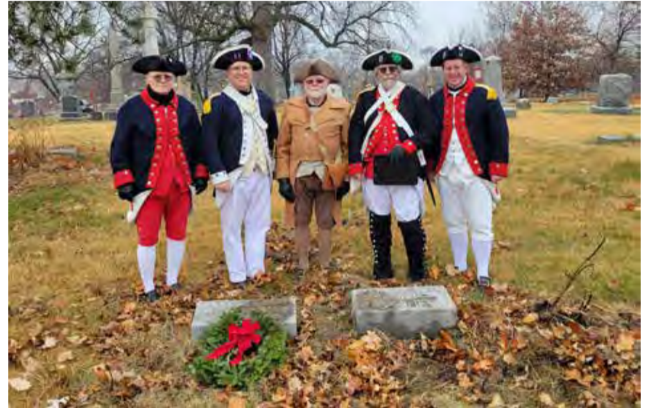
Dec 14 – Wreaths Across America -