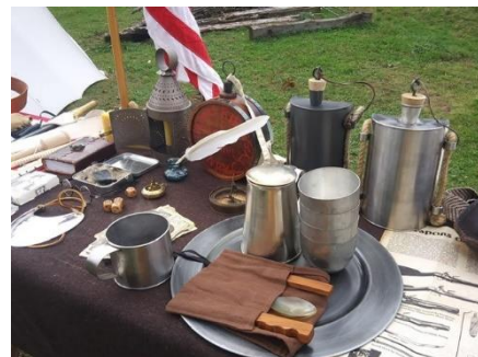
Patriot Chest and Traveling Trunk items