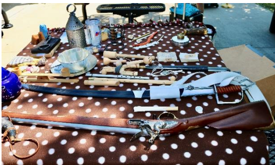
Patriot Chest and Traveling Trunk items